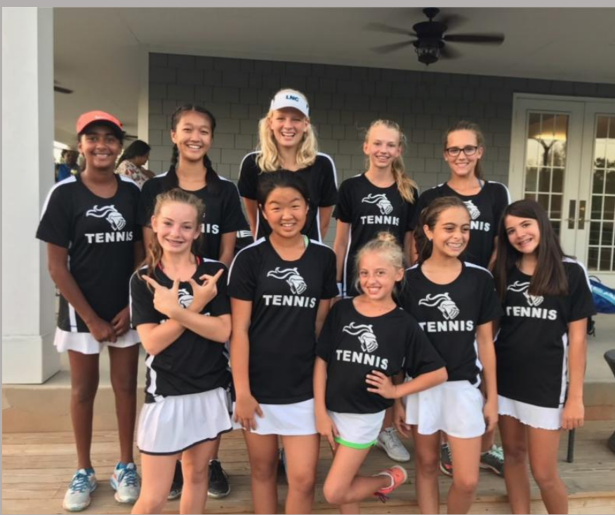
MS tennis team

If you have pictures of our Knights athletes, please send them to mjoseph@Incharter.org and slay@Incharter.org for posting on our website and on social media.